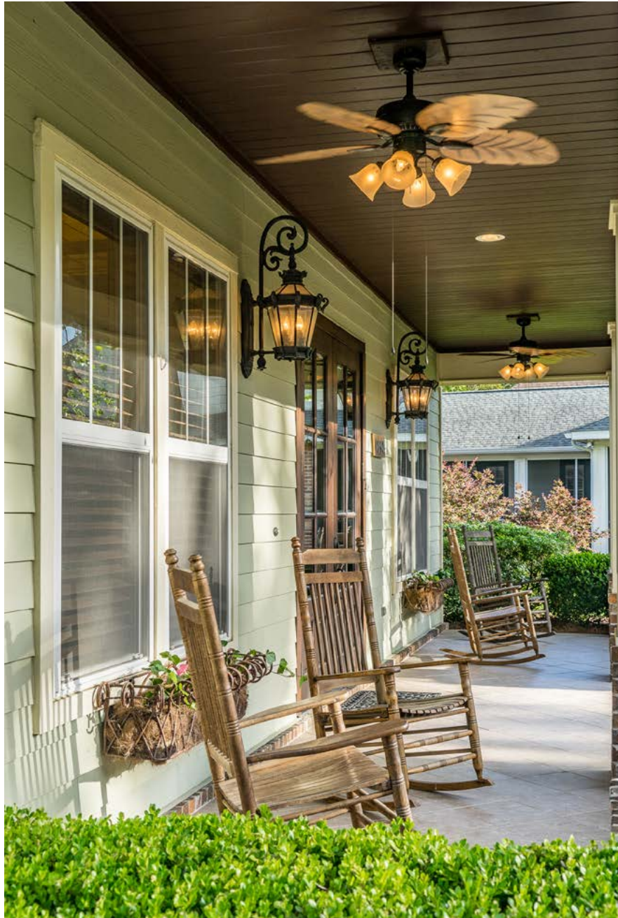
1664 Saint Lawrence Dr, Niceville