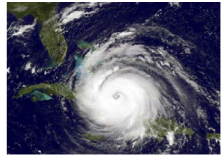
Left: Hurricane Opal in Destin Harbor 1995 Above: Hurricane Irma