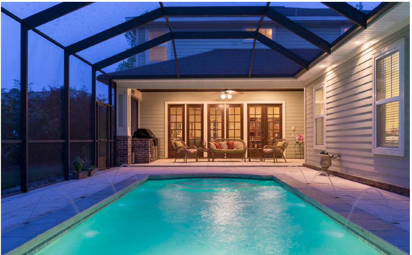
Pool, at 1664 Saint Lawrence Dr, Niceville